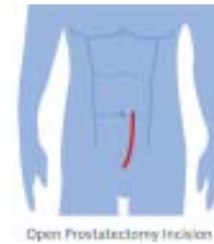
Open Prostatectomy Incision

One of the most common treatments for prostate cancer involves the surgical removal of the prostate gland, known as radical prostatectomy. Traditional radical prostatectomy requires a large, 8-10 inch incision. This open surgery commonly results in substantial blood loss, a lengthy and uncomfortable recovery and the risk of impotence and incontinence.