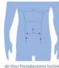
da Vinci Prostatectomy Incisions

If your doctor recommends surgery to treat your prostate cancer, you may be a candidate for a new, less-invasive surgical procedure called da Vinci Prostatectomy. This procedure incorporates a state-of-the-art surgical system that helps your surgeon see vital anatomical structures more clearly and to perform a more precise surgical procedure.